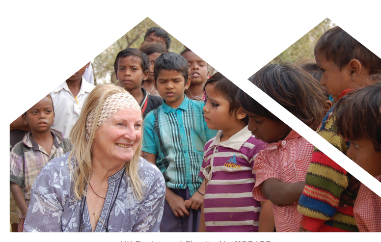
UK Registered Charity No 1165428