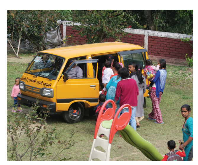
SPONSOR A NURSERY SCHOOL BUS AND RUNNING COSTS FOR 4 YEARS:

Play is a vital part of learning. Play equipment is expensive. We would like to improve the facilities we are able to offer. [£3000]